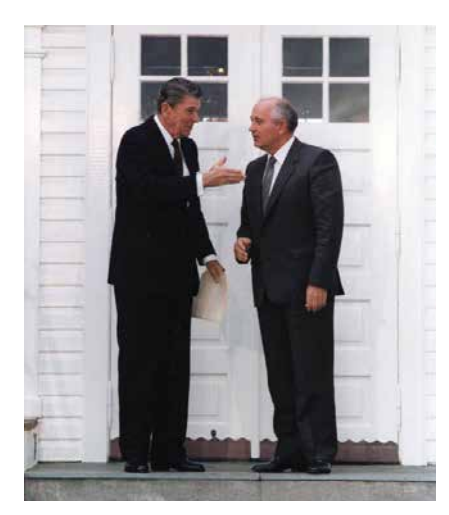
U.S President Reagan and Soviet General Secretary Gorbachev at the Hofdi House in Reykjavik, Iceland, during the Reykjavik Summit. 11/10/86

The original hydrogen bomb/X-ray scheme was scuttled in favor of other space-based weaponry, notably hypervelocity guns, particle beams