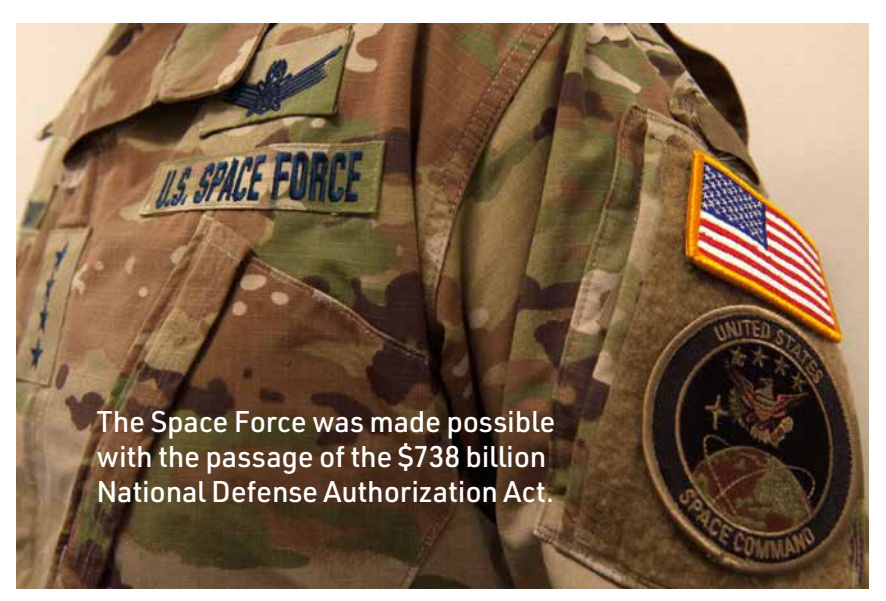
Space Force uniform. Combat utility uniform of the U.S. Space Force. US Space Force Wikimedia Commons

Outer Space Treaty provides that nations "undertake not to place in orbit around the Earth any objects carrying nuclear weapons or any other kinds of weapons of mass destruction, install such weapons on celestial bodies, or station such weapons in space in any other manner."