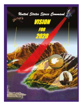
Cover of the US Space Command's 1996 Vision for 2020 report declaring its mission to dominate militarily in space.

the U.S. Space Force. This is a very big and important moment".