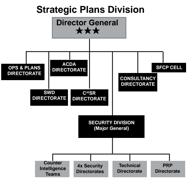
Figure 2. Strategic Plans Division.

for national security intelligence and articulation of the nuclear command authority. See Figure 2 for an organizational diagram of SPD.