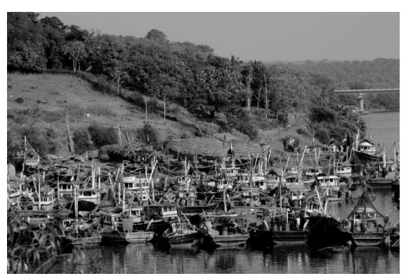
Around 15,000 fisherfolk face a threat to their livelihood