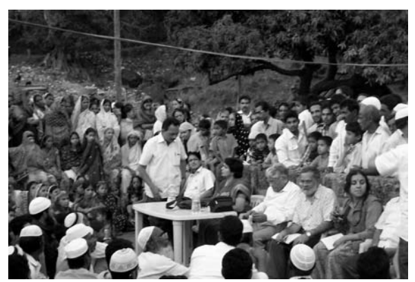
CNDP team in Nate village

The villagers, faced with repression, practise noncooperation by refusing to sell