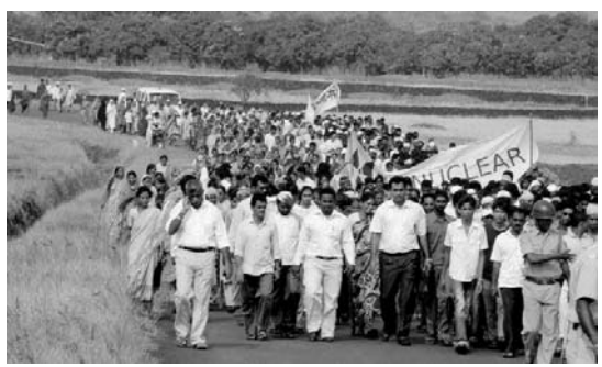
Vigorous protests, like this march, have become regular

However, all the five gram panchayats (democratically elected local governing bodies) in the affected area have unanimously passed resolutions opposing the