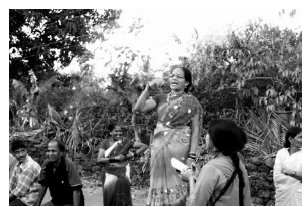
An enraged woman speaking in Madban