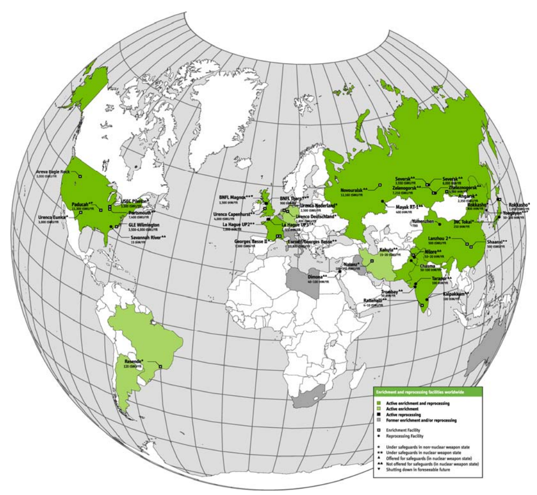
Figure 1. Reprocessing and Enrichment: Activities and Capabilities, 2009. See also Table 2 in Appendix A for a list of enrichment plants